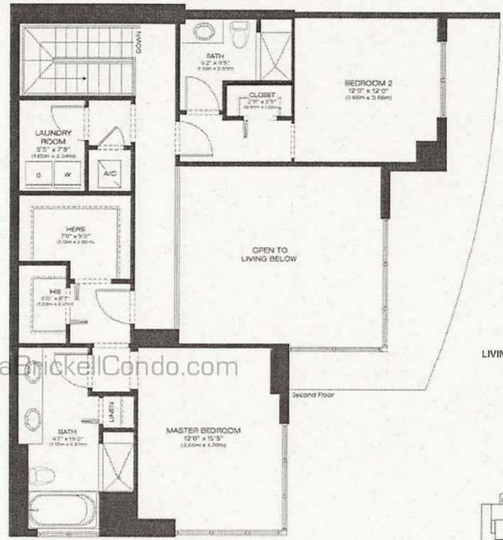
UNIT I (upper floor)