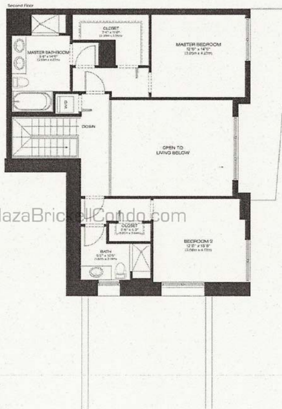
UNIT G (upper floor)